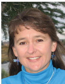
By Juliet M. Windes, Cereals Agronomist and Pathologist, University of Idaho

Cropping systems and crops vary tremendously in Idaho. In cooler, upper elevation areas of Soda Springs, continuous grain has been grown for decades. In the areas around the Treasure Valley, a tremendous diversity of crops from onions to sweet corn flourish under controlled irrigation. The fertile grounds of the Palouse are a perfect niche for soft white winter wheat, legumes and grass seed production. But times they are a'changin'.