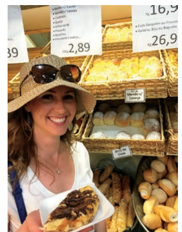
Important market research of the wheat products offered in Brazil.

Why Idaho? My best friend and her family live just 2 hours from Boise in Baker City, Oregon and my family is just an 8 hour drive away. That was a huge