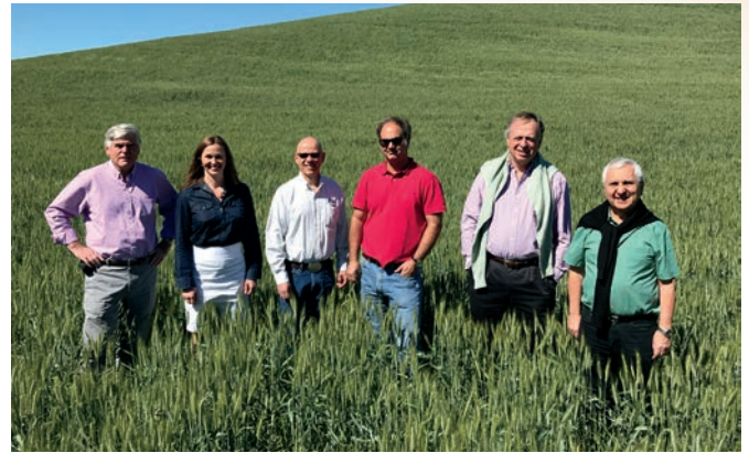
With a 2017 Chilean trade team that visited the PNW, including Lewiston, ID.

If you could have dinner with one famous person from history, who and why? Queen Elizabeth I. I have read extensively about her, she was incredibly intelligent, strategic and was able to remain independent and powerful throughout her reign. For a woman to achieve what she did in that era is impressive.