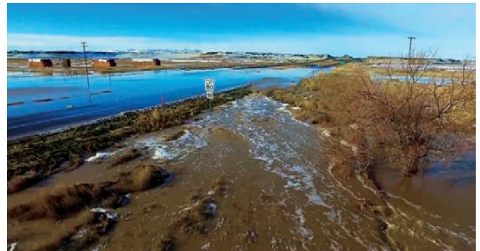
Raft River flooding in 2017 shut down I-86 between Burley and Pocatello.

The Flood District, RAFT RIVER RECHARGE GROUP LLC (RRRG), and Raft River Electric (RRE) have partnered on the Raft River Watershed Project. Previous work by the RRRG included preparing a feasibility study for groundwater recharge that incorporates flood control through detention/recharge ponds. The design and development of the recharge basin infrastructure will enable diversion of flood flows into the off-channel recharge basins. Flood flows from recharge are intermittent; therefore, additional water from outside of the Raft River Basin will be necessary to bring the aquifer withdrawals into balance and help