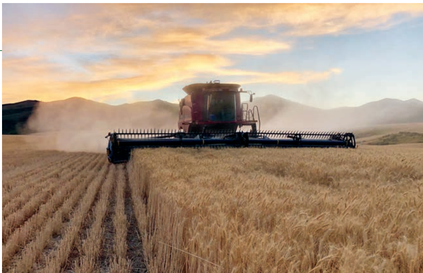
Submitted by Jamie Kress.