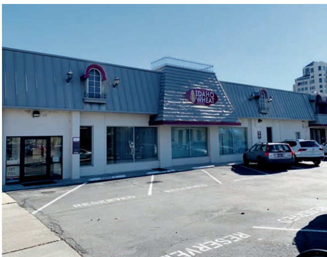
Current Idaho Wheat Commission Building

The Wheat Commission is working with the State Building Authority and the Division of Public Works on the new building project, with the intention of using the state's bonding authority in addition to cash reserves to finance the building. Current estimates for