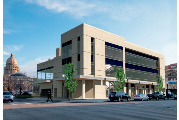
A rendering of the proposed Idaho Wheat Commission building courtesy of Larson Architects.

This building project has been in the works for a long time and it has been well planned. Wheat