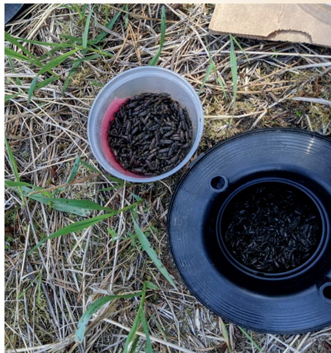
Pheromone traps filled with Adult Click beetles.

Measuring volatile chemicals and CO 2 concentration emitted from plant roots suggested that wireworms use both CO 2 and various root volatiles to identify and select its host plant. Interestingly, however, it is not just